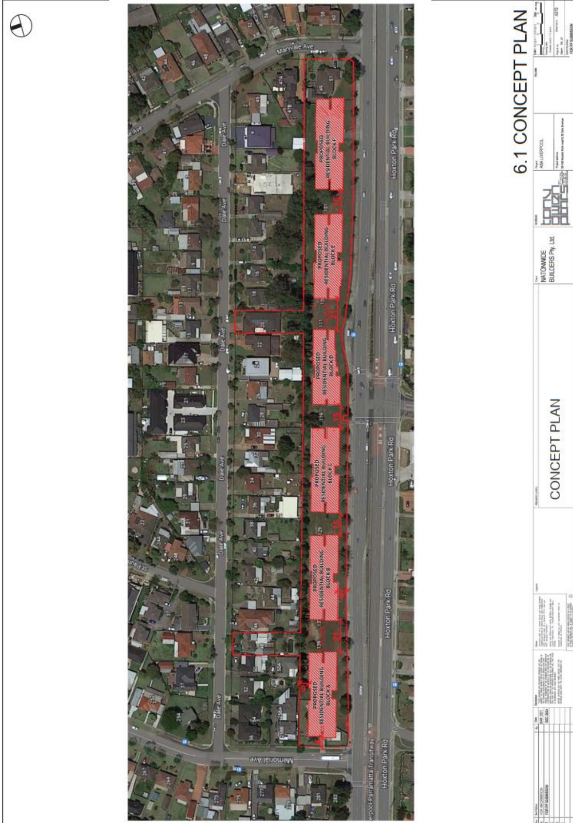
Figure A 3.2 Concept Plan