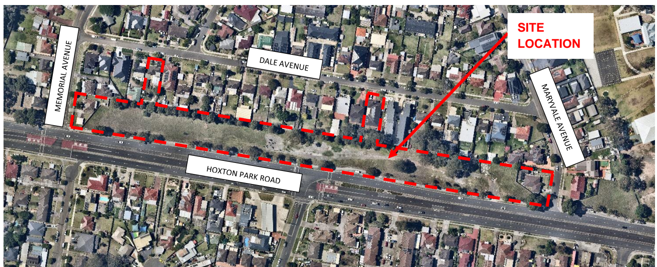
Figure 1 Locality Plan

The site is located on the northern side of Hoxton Park Road and is bound by Memorial Avenue, to the East, Maryvale Avenue, to the West and adjoining properties on Dale Avenue to the North.